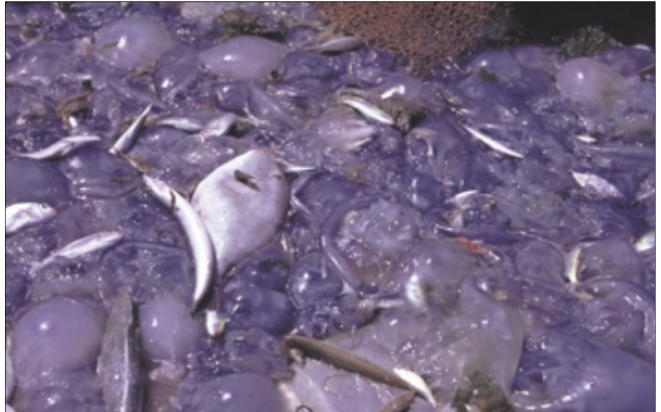
The Scyphozoa jellyfish Rhopilema nomadica

Other abundant invaders are exploited commercially. An early Erythrean invader, the swimming crab Portunus pelagicus , was recorded from Port Said in 1898. This crab soon became abundant and in the early 1900s