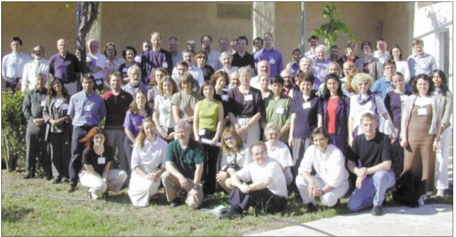
Delegates at the Euroconference in Corinth, Greece

few years the concept of ecosystem engineers has gained a lot of attention. Some of these ecosystem engineers are also 'keystone' species, species which determine to a large extent the functioning of an ecosystem. Species which perform similar roles in the ecosystem can be grouped together. This is particularly useful and even essential for ecological modelling which has a limited number of variables.