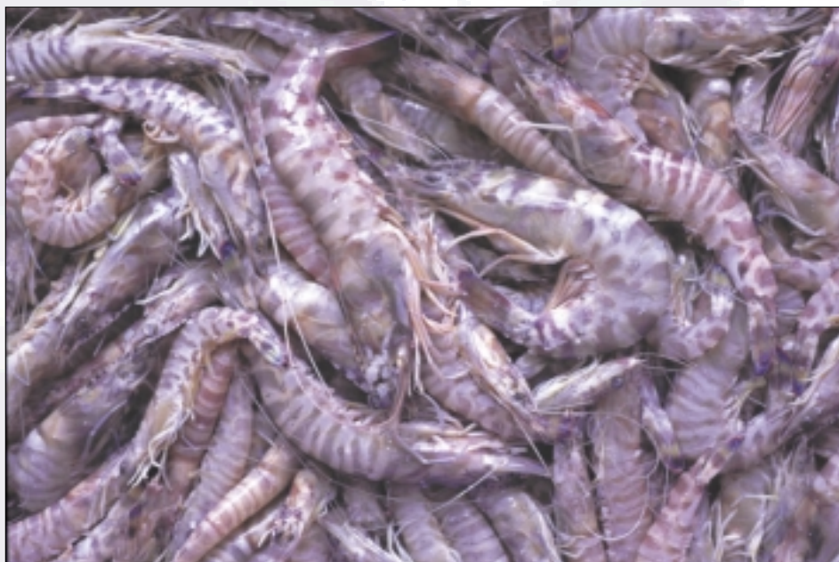
The Japanese tiger prawn Marsupenaeus japonicus in the fish market at Jaffa, Israel

Unrestricted transport of commercially important, alien oysters has resulted in numerous unintentional introductions of pathogens, parasites and pest species: a comprehensive compilation of marine macrophytes that were introduced into the Mediterranean by way of oyster-farming includes 15 species; 10 are native to Japan. The alga Sargassum muticum , successfully introduced into the coastal lagoons of Languedoc and northern Spain with C. gigas , has rapidly covered artificial substrates and negatively affected native algae. Indigenous species are now nearly absent amongst the dense stands of S. muticum . At Thau lagoon, S. muticum has locally displaced the indigenous Cystoseira barbata by blocking light and thus inhibiting the recruitment of the native species.